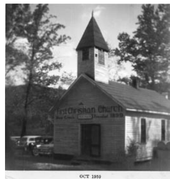
New Haw Creek Church, 1959

When one of the men was sick and unable to farm, the other men would do his farm chores. People cared and shared with each other.