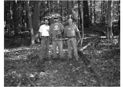
Wielding chainsaws and muscle, 16 employees from Office Environments of Asheville, including these three who paused to pose, helped improve the grounds at Haw Creek Elementary on United Way's 2008 Day of Caring, Sept. 4.

For more information, call the school at 298-4022, or visit the website at www.buncombe.k12.nc.us/hces .